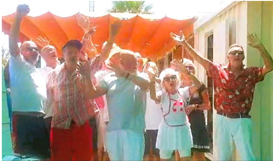
'WE ARE THE CHAMPIONS' - The victorious south team revelling in their victory